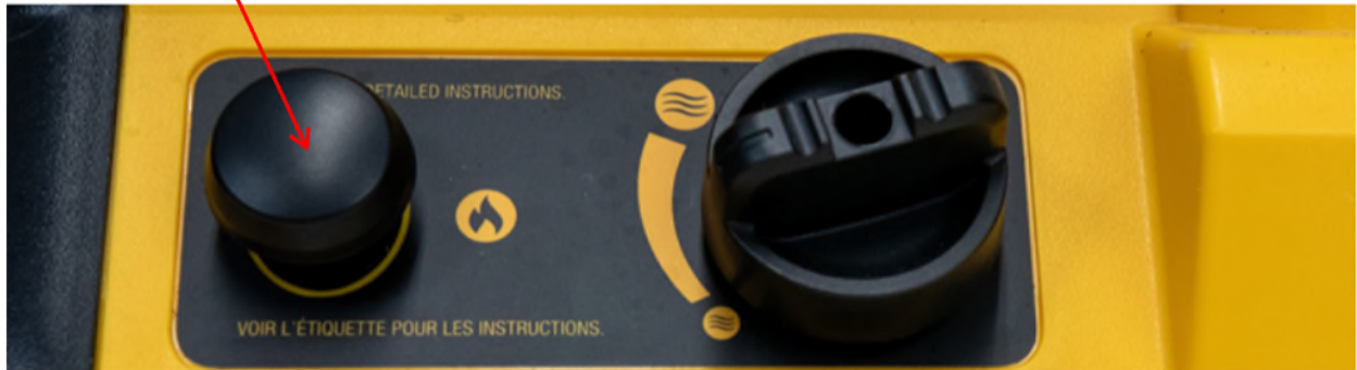
Gas Igniter Valve Button