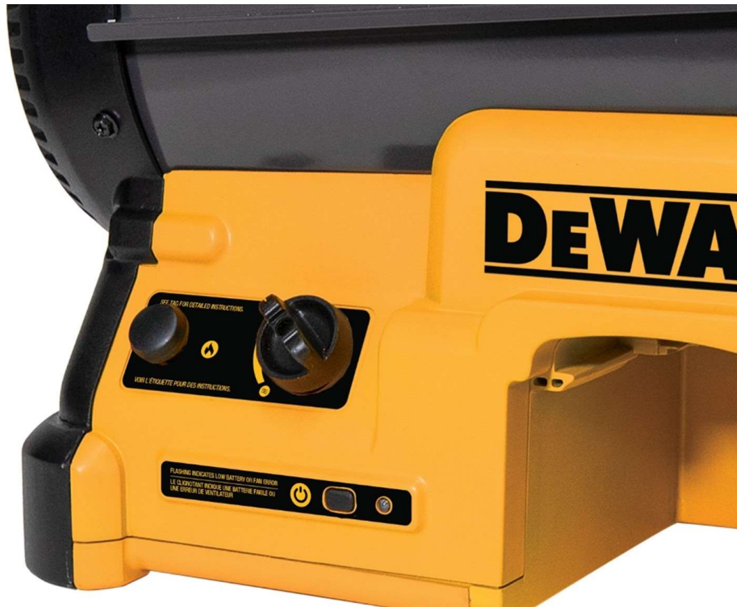
Gas Igniter Valve Button; On/Off Switch; and Green LED Light on the recalled DEWALT 70,000 BTU outdoor portable cordless forced air propane heater Model DXH70CFAVX