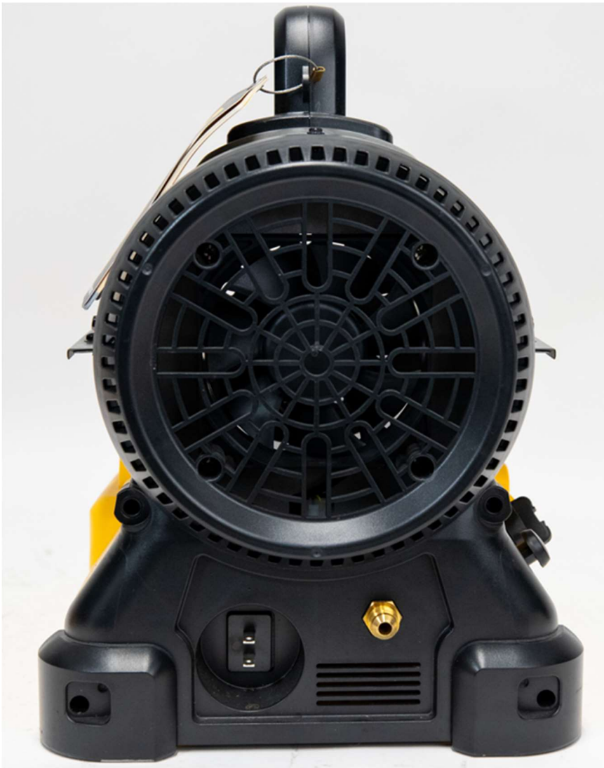
Fan location on the recalled DEWALT 70,000 BTU outdoor portable cordless forced air propane heater Model DXH70CFAVX